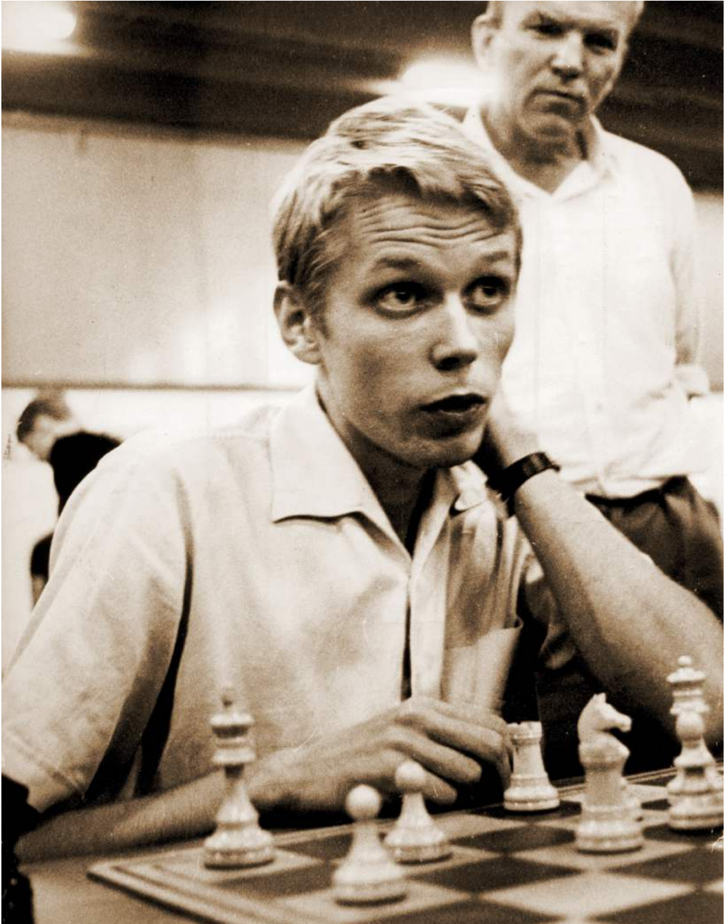
At the Swedish Championship 1967.