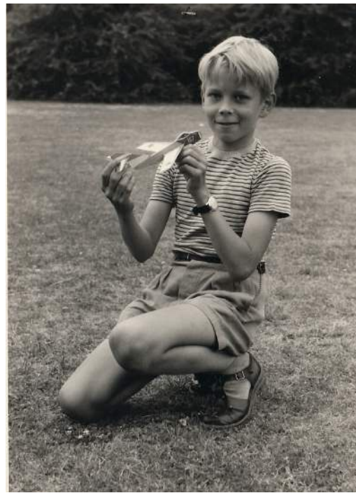
Summer 1952 in Malmö.