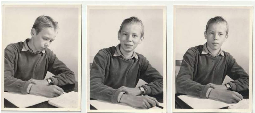
Left side: The apartment on Tessin's road 1954.