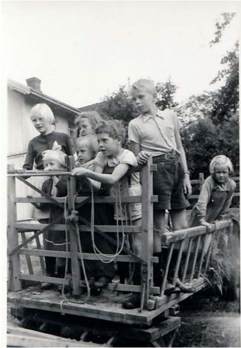
With neighbours in Rødberg 1954.