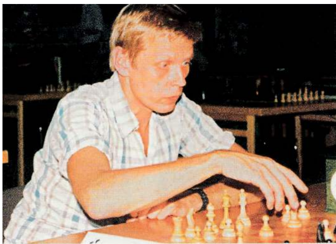
For once in a shirt that isn't all white.