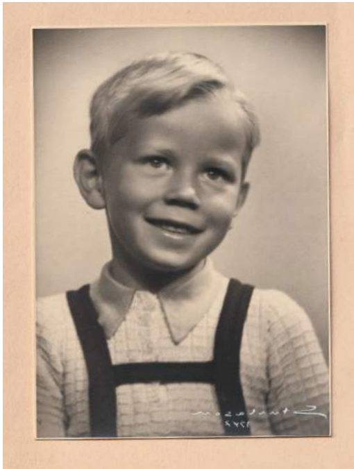
Pictured as a 5-year-old.

dusty. When they had guests, she would carve "Welcome!" in the dust.