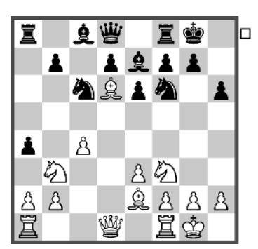
Position after: 11... a4

White is unable to maintain the blockade on d6-square.