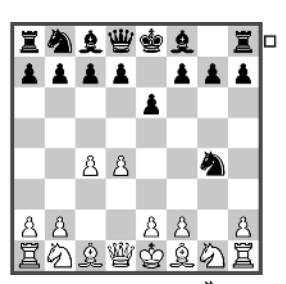
Position after: 3... 2xg4!

B) 3. g4 This is an Incredibly entertaining move which does not really work with accurate play by Black, but it leads to unbalanced positions which can be tricky to play. At the top level, It was first tried in 2022 by Shakhriyar Mamedyarov against Andrey Esipenko and later there were more top games here. 3... *\( \infty \text{xg4!} \)