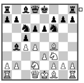
Position after: 6... d6!

8. \hat{\mathbb{Q}} g3 h5!∓ and White must play h3 or h4 to save the bishop, which allows ... \hat{\mathbb{Q}} xg3 and White has to recapture with the f-pawn. That, of course, is great for Black.] 6... d6!