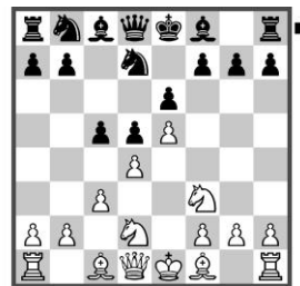
Position after: 6. c3

This line is a clever way for White to postpone his decision. It avoids the 5...a6 line in the IQP variations. 4... ♘f6 [4... ♘c6 5. exd5 exd5 transposes to the main line.] 5. e5 ♘fd7 6. c3