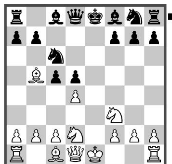
Position after: 6. ♙b5