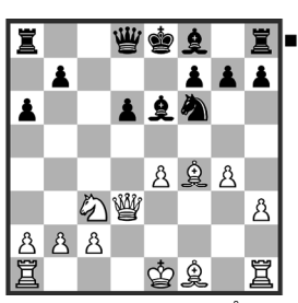
Position after: 11. 2xf4