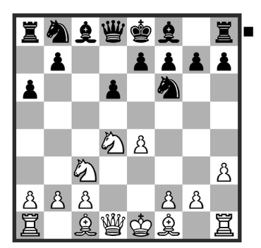
Position after: 6. h3

1. e4 c5 2. 🖄 f3 d6 3. d4 cxd4 4. 🖄 xd4 🖄 f6 5. 🖄 c3 a6 6. h3