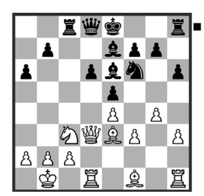
Position after: 13. f3!N